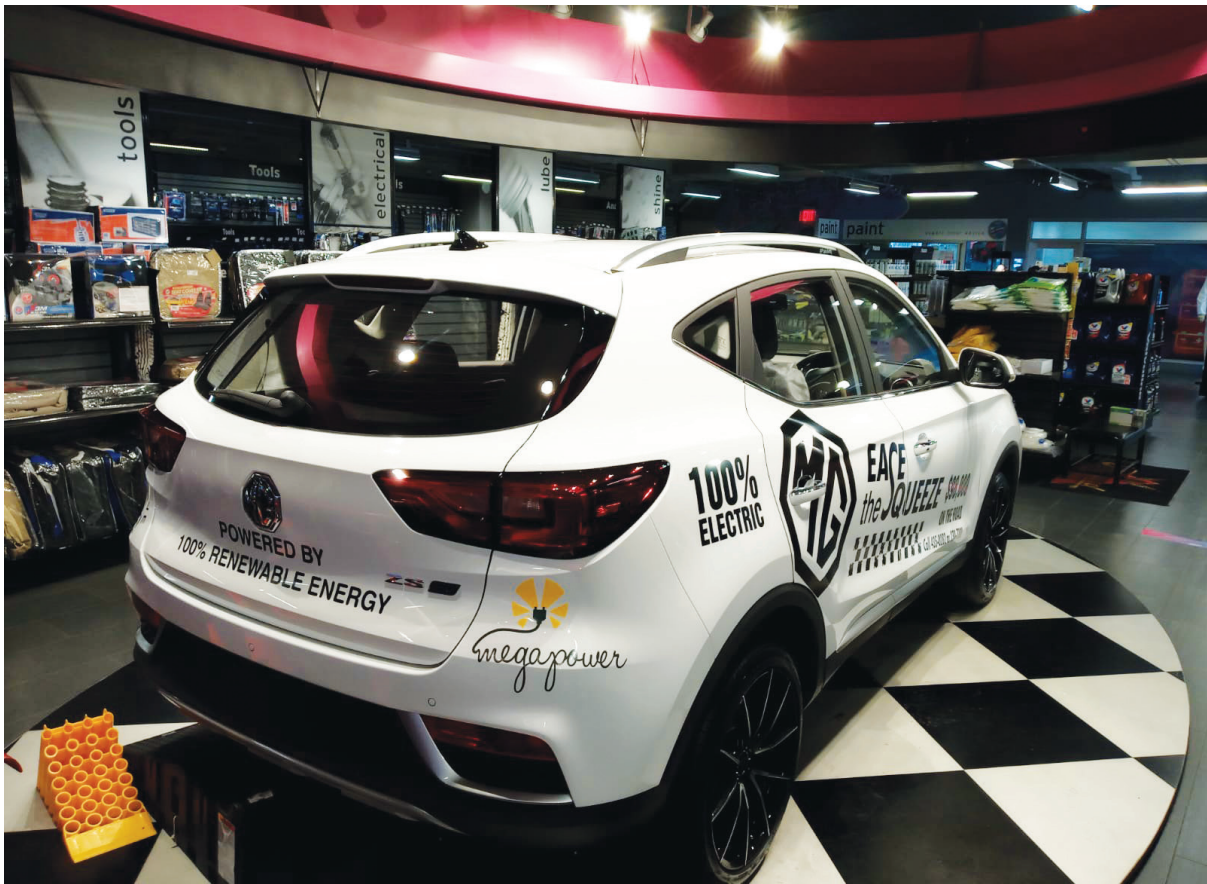
Megapower, dealer for manufacturer SAIC Group, launched the first 24 MG ZS SUV EVs in Barbados with many more on the way. For more information, visit www.megapower365.com .

The Ministry of Energy is highly active and influential in supporting EV adoption. To date, Megapower has supplied 14 EVs to various government ministries and agencies through Inter-American Development Bank loan projects with the Government of Barbados. To further pioneer electric transport in Barbados, the Government also introduced 33 electric buses in July 2020 with the goal of 100% electric vehicles for transport over the next decade.